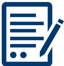
Customer Account Information Form

Open an account only with a PSE-accredited stockbrokerage company or Trading Participant (TP). A complete list of information about all the TPs who are authorized and qualified to trade securities can be found on the PSE website ( www.pse.com.ph ).